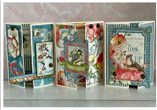
– Bird Watcher Gatefold Card Set –